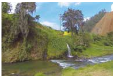
Value of Life