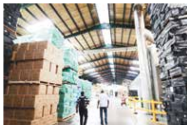
Garbage or Resource: A Dominican Republic Experience

http://documentaries.globalfoundationdd.org